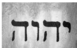
(Four Hebrew letters that the Jews used to indicate God without writing God’s name)

In our first year Theology in Teutopolis IL in 1964, we seminarians were given a book to read in Scripture Class. I have never forgotten this book. This book was entitled: “Is Your God too Small?” Most of us want to make God much smaller than God truly is. Perhaps this has to do with control – we like to have control of everything including God. If there is not control, then what? And that is the point.