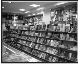
Lower Level of St. Peter's Church